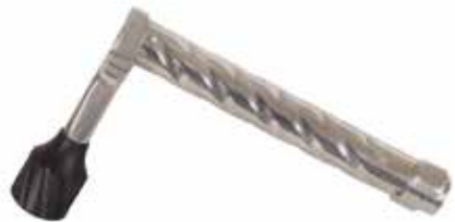
BOLT AND BOLT KNUB