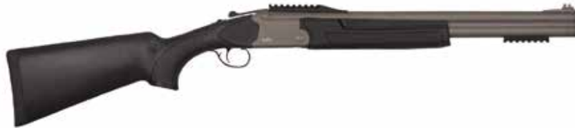
S T A C 3