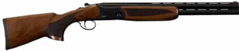
S T A C 1