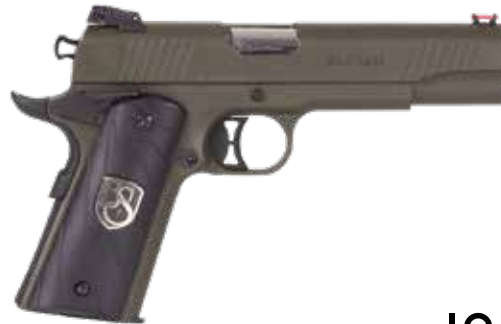
BLK 1911 C08