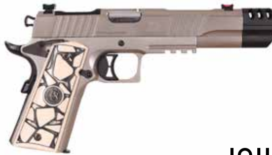
BLK 1911 SPORT B02