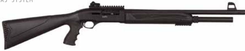
R 570 M