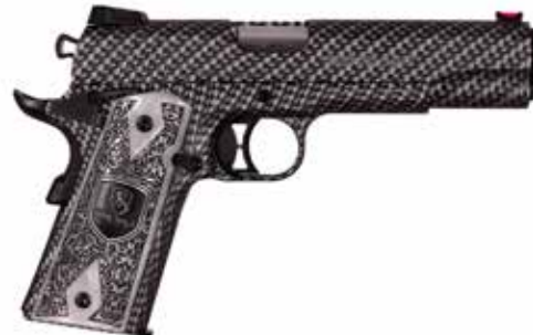
BLK 1911 C02