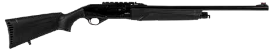
R 568 M