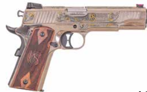
BLK 1911 E01