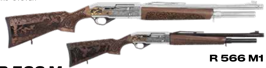
R 566 M