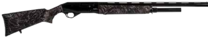
R 574 M