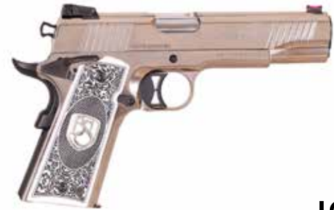
BLK 1911 B04