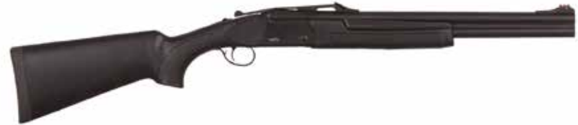
S T A C 2