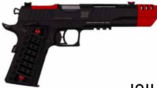
BLK 1911 SPORT B01