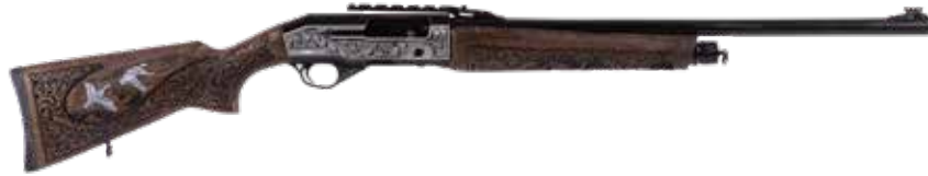
R 565 M