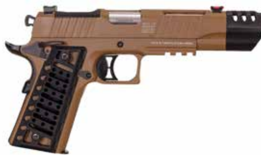
BLK 1911 SPORT C01