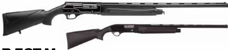
R 567 M