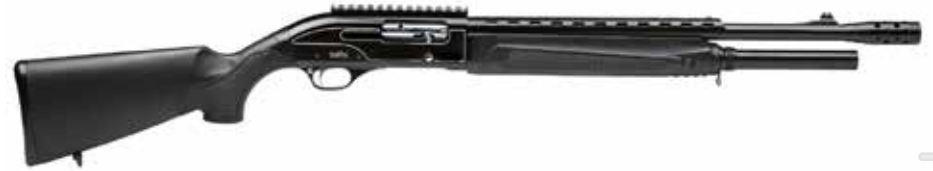
R 571 M