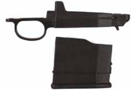
MAGAZINE KIT 5 ROUND ( 300 MAG 4 ROUND )