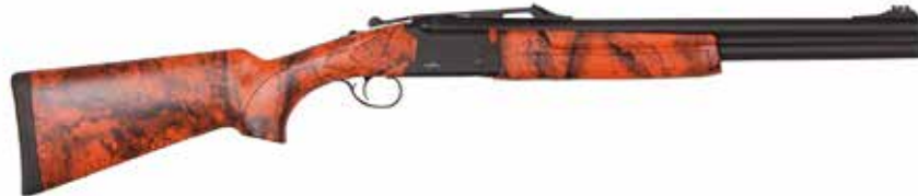
S T A C 5