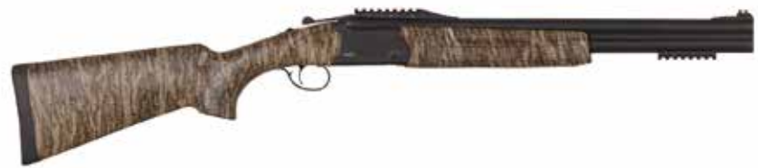
S T A C 4