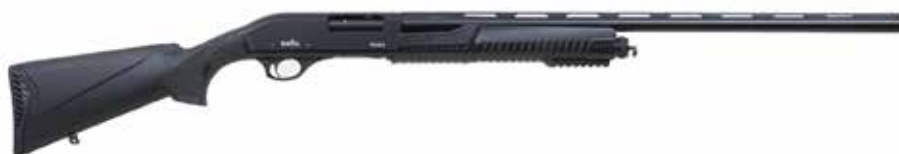
P 610 Y