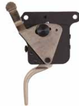
ADJUSTABLE TRIGGER ( 1.5 IBS - 4 LBS )