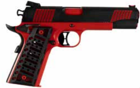
BLK 1911 C06