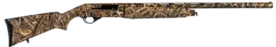
R 575 M