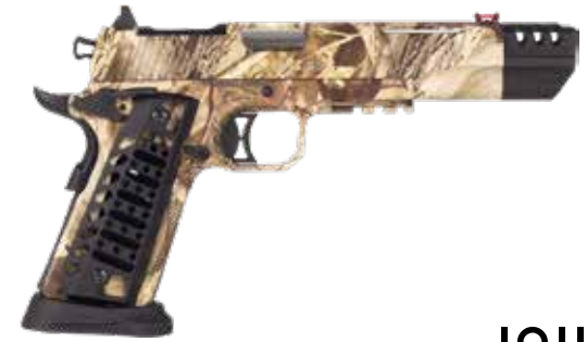
BLK 1911 SPORT C03