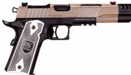
BLK 1911 SPORT B03