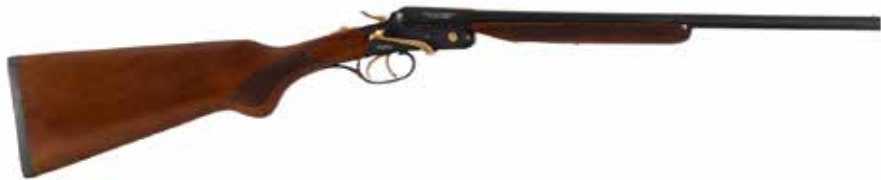
A 842 H