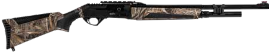
R 572 M