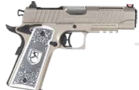
BLK-1911 COMPACT M-B03