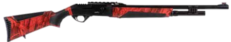
R 573 M