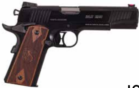
BLK 1911 B02