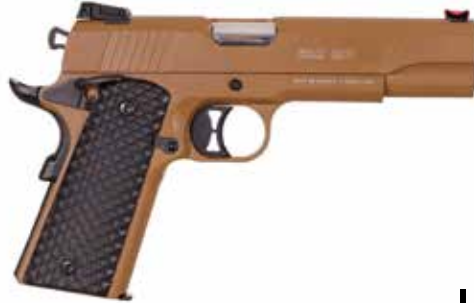
BLK 1911 C04