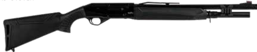
R 569 M