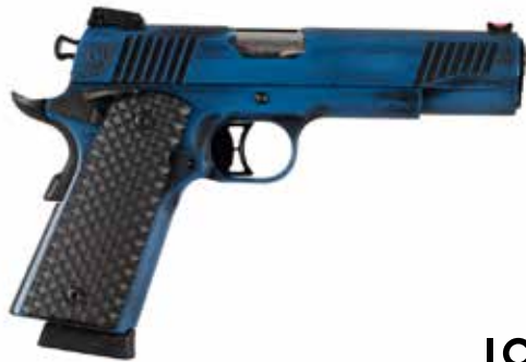
BLK 1911 C07