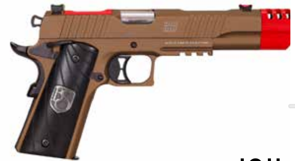
BLK 1911 SPORT C02