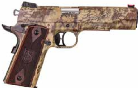
BLK 1911 C01