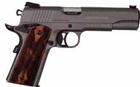
BLK 1911 C03