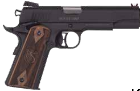
BLK 1911 B03