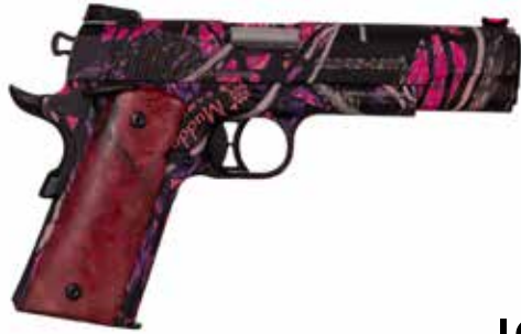
BLK 1911 C05