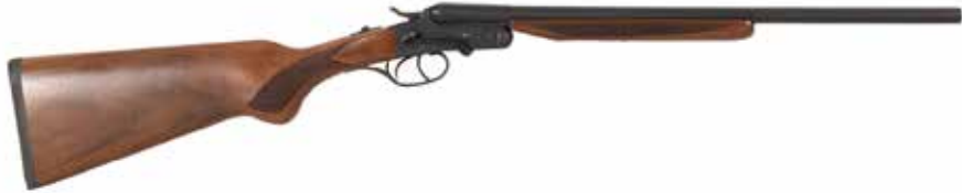
A 841 H