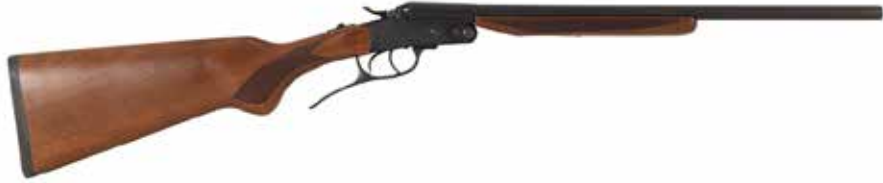
A 840 H